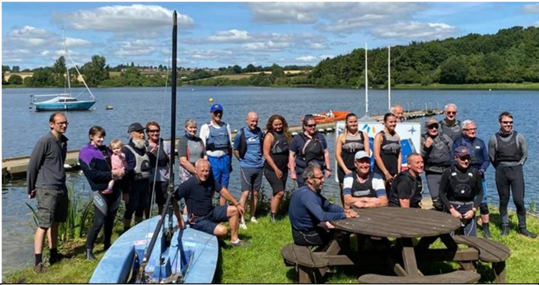
Cransley Comet Open Competitors

There's something predictable that occurs every summer at Cransley when the Comets arrive, just like swallows arriving back the same time every year from Africa - and that is all those who take part know they have been through the full spectrum of wind strengths and directions in the space of a few hours!