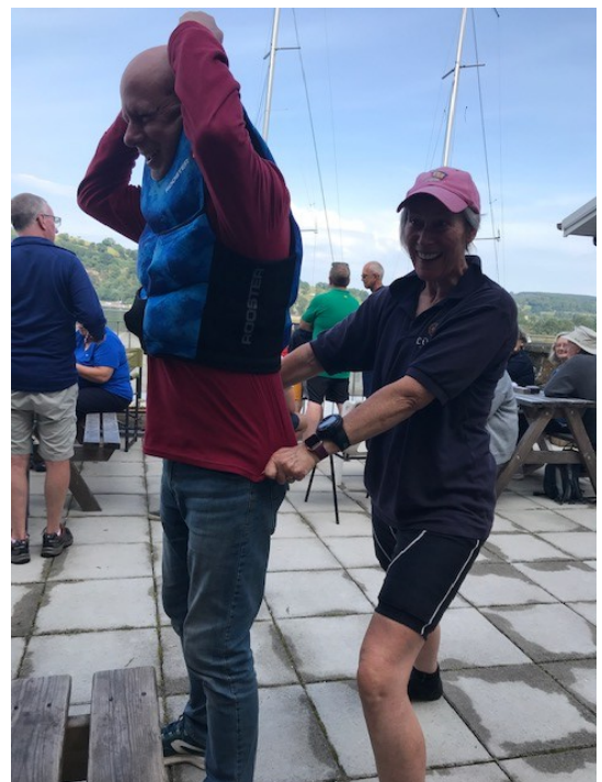
Inky Pinky helping to undress Rear End Roger