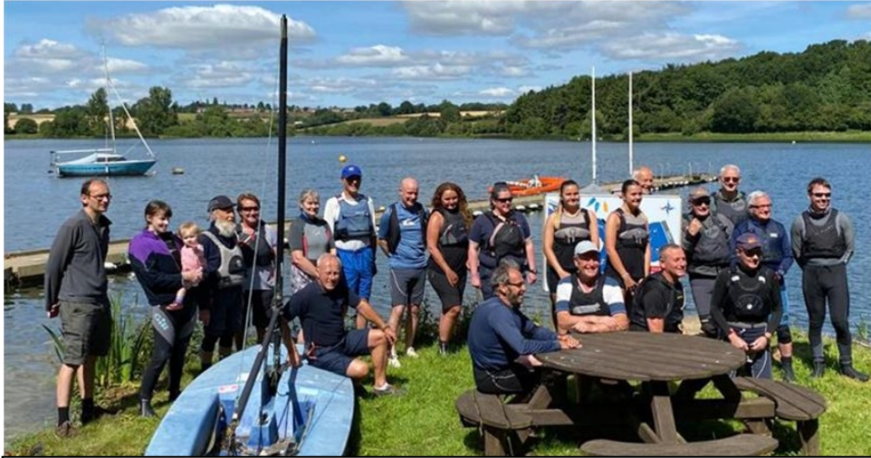
Cransley Comet Open Competitors © Sue Bull

There's something predictable that occurs every summer at Cransley when the Comets arrive, just like swallows arriving back the same time every year from Africa - and that is all those who take part know they have been through the full spectrum of wind strengths and directions in the space of a few hours!