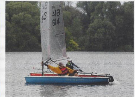
There were Xtras !