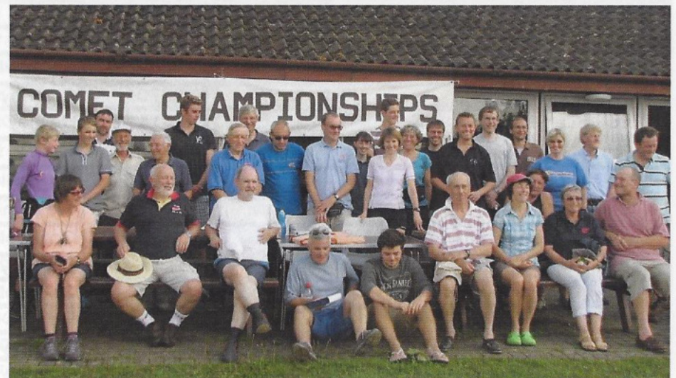
Here are the rest of the competitors